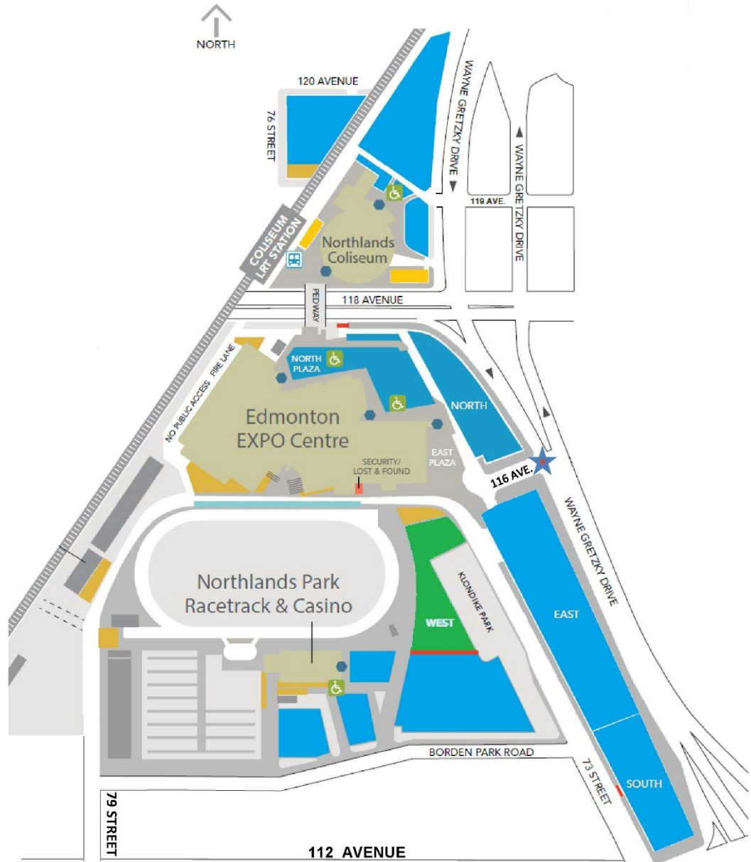
EXPO CENTRE PARKING MAP ACCESS VIA 116 TH AVE.